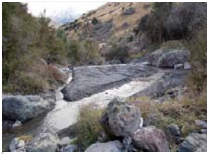
IMG2: The weir across the river to retain water and regulate flow