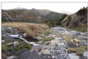
IMG7: Water return to river

that travels 2.1km downhill through a pipeline, into a 1 metre deep trench to the turbine and battery bank.