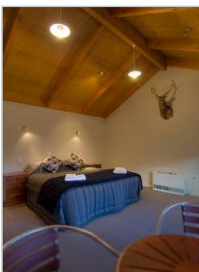
IMG17: One of the lodge bedrooms

inverters. “These invert battery power into normal power as we know it” says Nick. Also installed in this room are the master outward-bound power distribution board and controller.