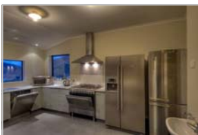
IMG15: The lodge kitchen