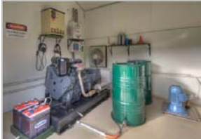
IMG9: Hydro turbine mounted on base plate