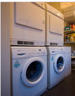
IMG16: The lodge laundry