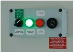
IMG13: Controller within lodge