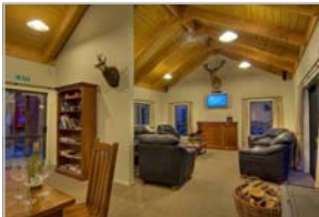
IMG14: The lodge living area