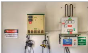
IMG10: Constant volt charger (left) and turbine controller (right)