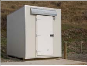
IMG18: Walk-in chiller