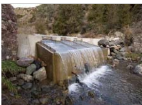
IMG4: Filtered water intake