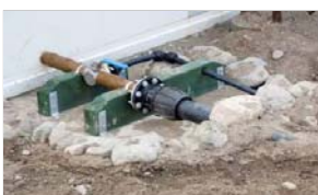
IMG6: Water input to powerhouse