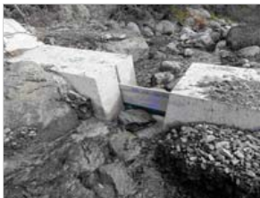
IMG3: The fish ladder; a resource consent requirement