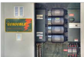
IMG12: Inverter electrics

three streams), the pipeline also flows through a steel pipe to cross a stream above flood level, before ending up at the power station connected to the turbine. Once run through the turbine, the exhausted water falls into a fibreglass pit and returns to the river.