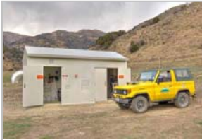
IMG8: The powerhouse; battery and generation room