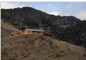
IMG1: Glazebrook Lodge

Cost-effective power system capable of running 3 upmarket homes. Certified to NZ and Australian standards.