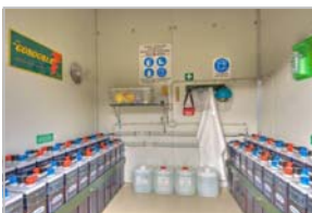
IMG11: The battery room for energy storage