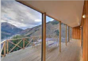
IMG19: The lodge verandah